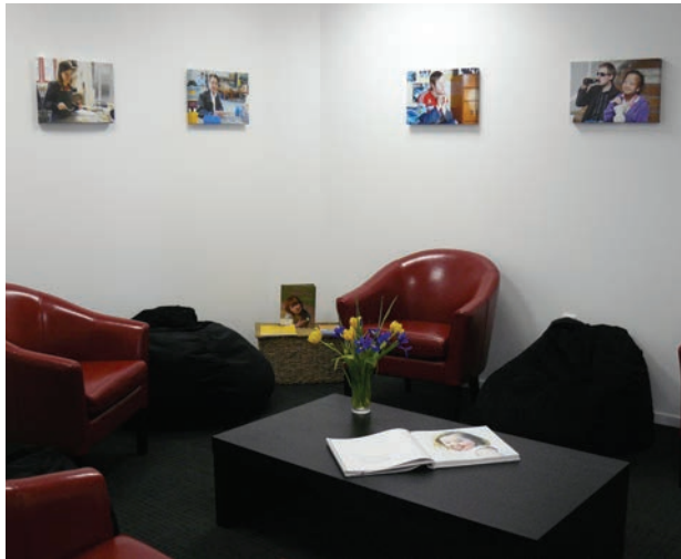
Reading and viewing room

JOURNALS DVDs CD-ROMs INTERNET BOOKS KITS